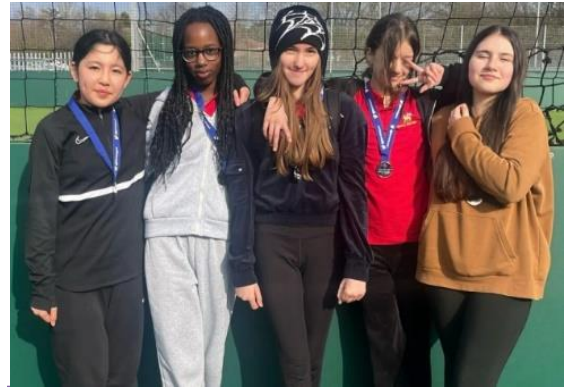
Year 8 Silver Medalist's: Team Northern Ireland

Despite playing in the pouring rain across three netball courts in 2023 for International Women's Day, Hendon students were determined to be part of the 'Biggest Football Session Ever' once again in 2024. Upgrading to Mill Hill Powerleague and doubling the amount of girls playing football, this year had all the makings of a memorable day. The Year 7 and 8 girls were fantastic from the get go. Competing in a league format until lunch, the girls had a lot of football to play. Their efforts, organisation and sportsmanship were superb as they competed vigorously for a top 4 spot. In a celebration of skill, unity, and girl power, 12 Year 7 teams, each representing a nation, battled it out on the pitch in an electrifying International Women's Day football tournament for girls. From the fierce determination of England to the flair of Spain, and the underdog spirit of Northern Ireland to the tenacity of Albania, the competition was a testament to the growth of women's football.