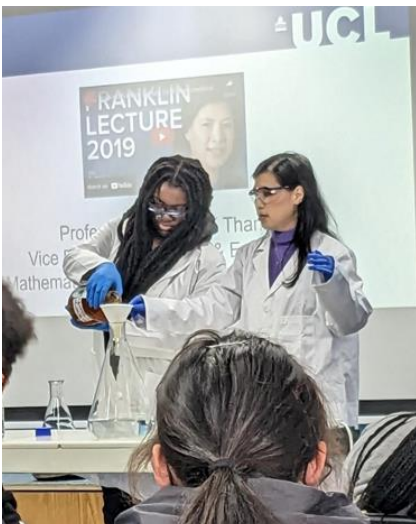
Joy (10.8) conducting an experiment on nanoparticles with Professor from UCL

This trip helped the students to relax and interact with different peers. The students took part in several activities, such as raft building, team building activities, capture the flag and climbing Jacob's Ladder.