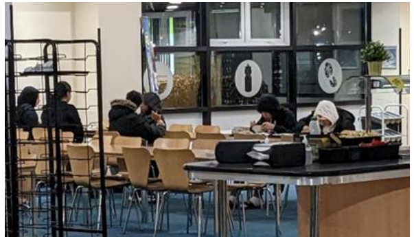
Students having Suhoor (breakfast) at 4am for Ramadan