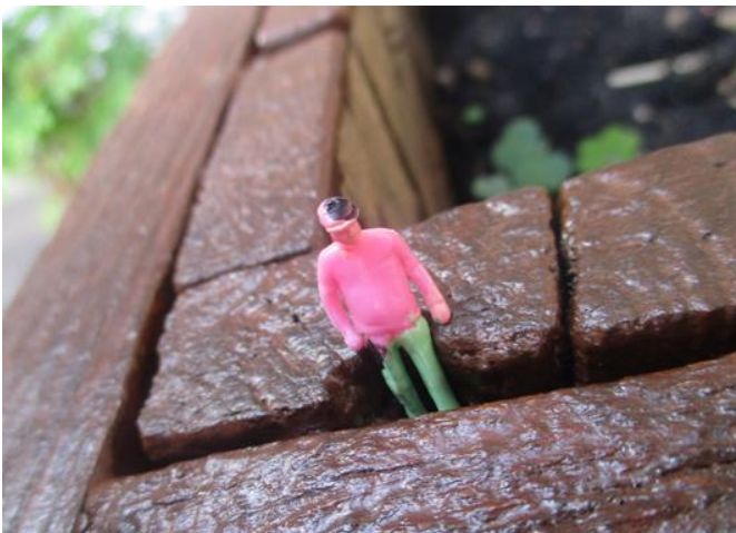
By Derya Karapinar