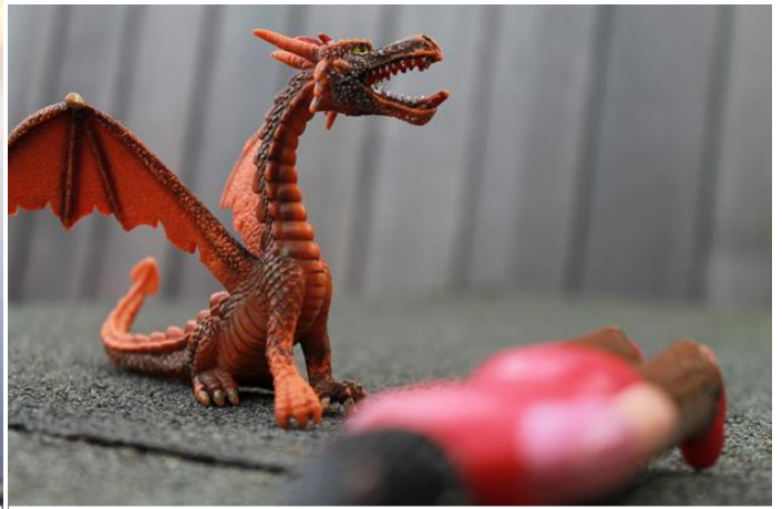
By Myles Rowe