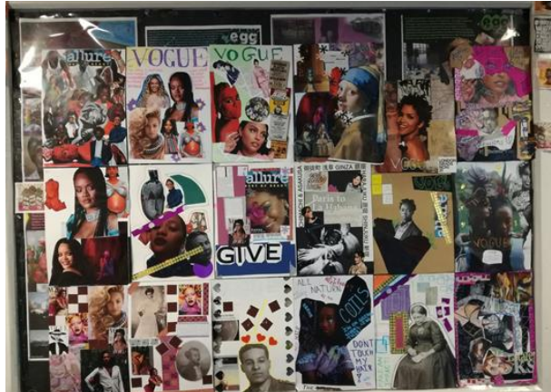
Student collage display in C block entrance