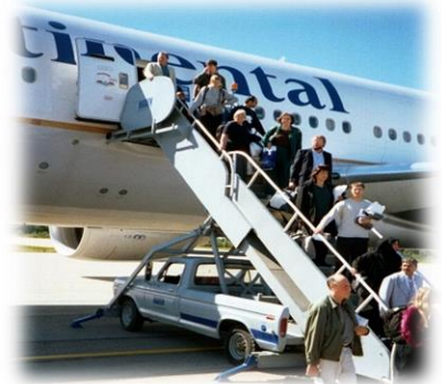
The "Plane-People" arrive in Gander

The modern musical Come From Away , details the real world events that several thousand passengers went through during the tragedy of 9/11. After the initial attacks in New York that fateful day, thousands of planes were forced to land all over North America to prevent any further attacks taking place. Some 38 of these planes (approx. 7000 people) were forced to land in the small town of Gander in Newfoundland, Canada (pop. 10000). The people of Gander mobilised into action after a state of emergency was declared to take care of the