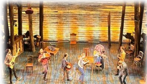
The musicians in the band