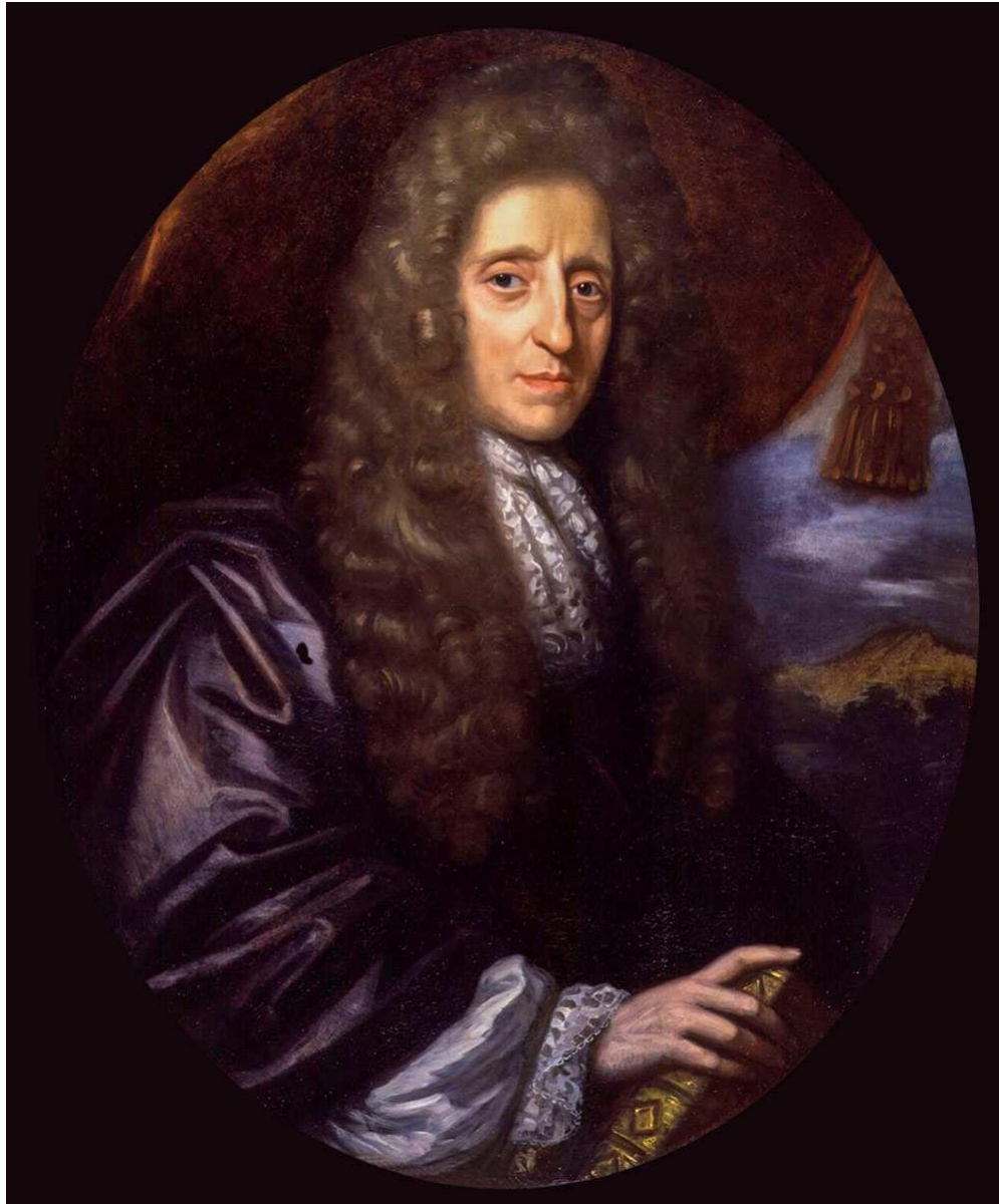
John Locke, by Herman Verelst, c. 1689

Locke argues that without a governmental body of some form, these states would devolve into violence rooted in fear and lack of confidence in their protection. The Social Contract , therefore, becomes a mutual agreement that the people of a state surrender some (not all) of their rights to government, in exchange for the protection and peaceful social existence that the law provides.