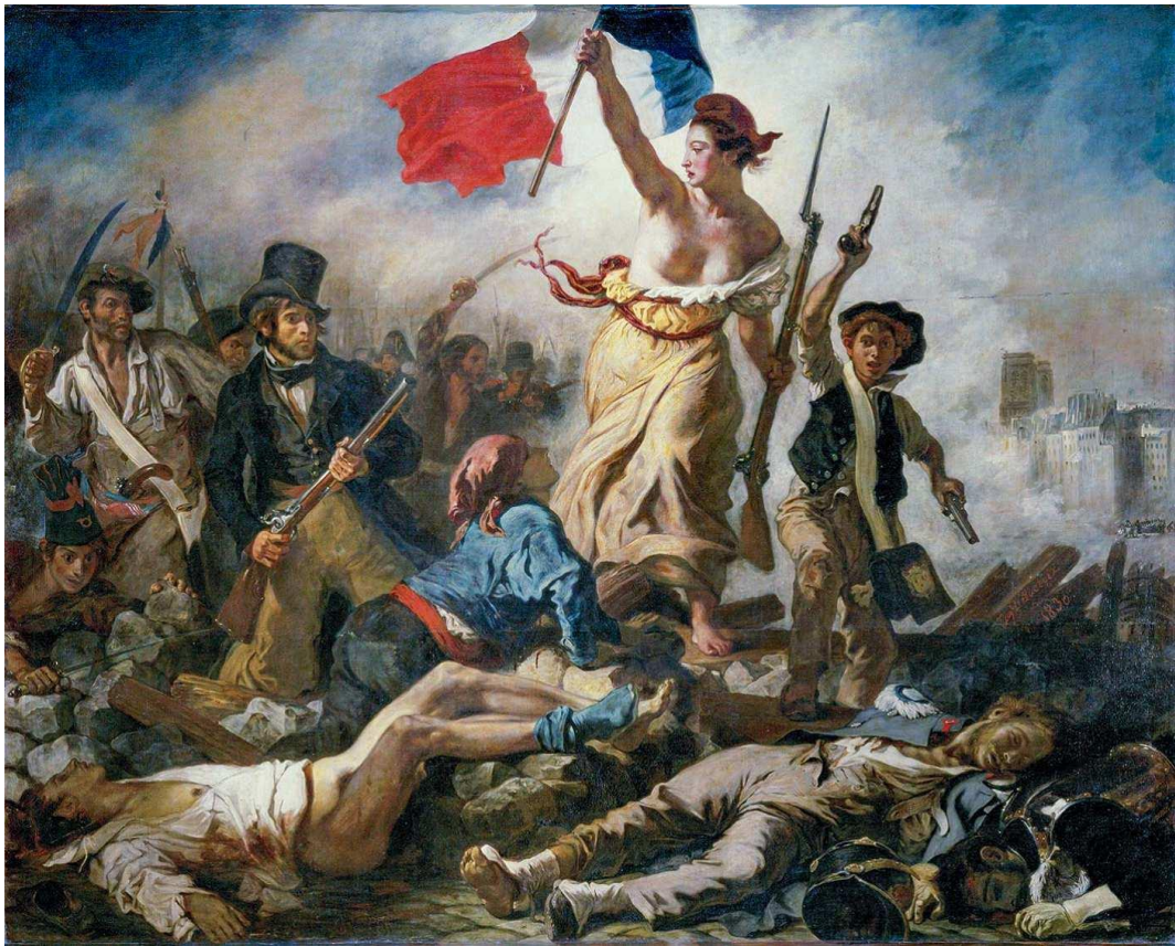
Liberty Leading the People, by Eugène Delacroix, c. 1830

Locke made a significant impact on the revolutionary generation of the final quarter of the eighteenth century in the United States and France. In his time, Locke's right to revolution was one of the most radical political statements ever made, changing the world in its wake .