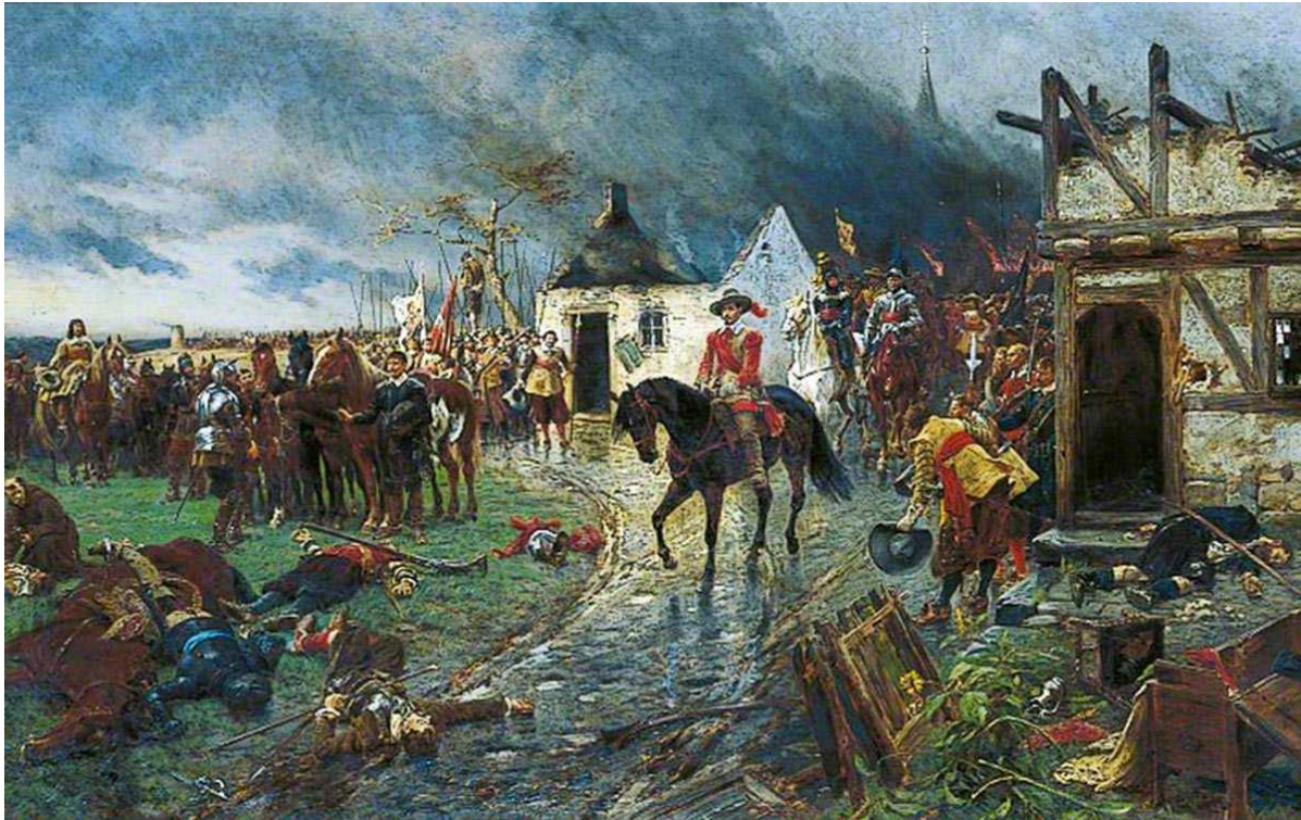
A Scene of the Thirty Years War, 1884, by Ernest Crofts

John Locke wrote extensively on the subject of toleration . It is likely that this was a lesson taught to him — or an idea that dawned on him — during his experience observing the English Civil War in his youth.