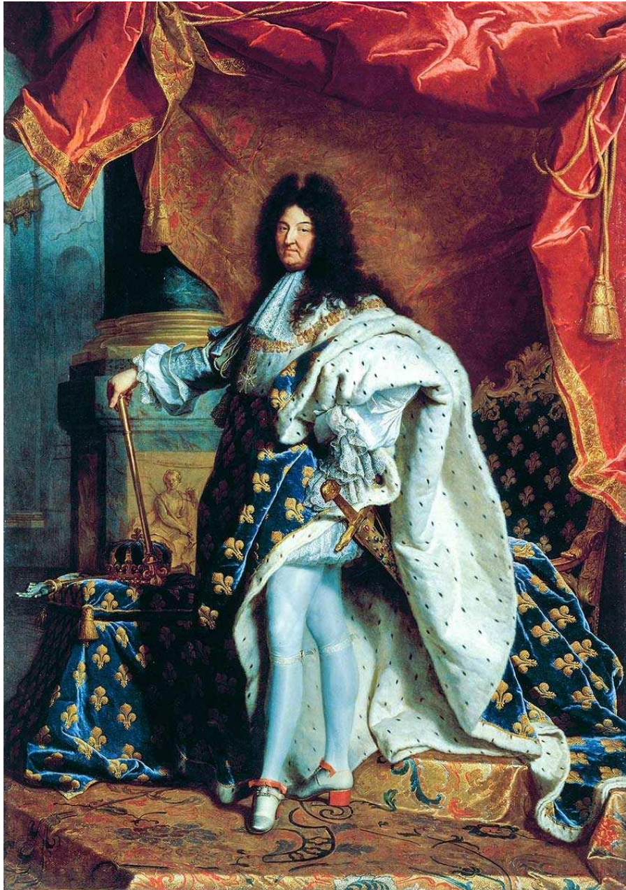
Portrait of Louis XIV , by Hyacinthe Rigaud, c. 1700

Robert Filmer, a contemporary of John Locke, justified monarchy by advocating the divine right to rule, represented here by the famous French Sun King, Louis XIV (r. 1643-1715), and the King being the earthly representation of God. Locke wrote a detailed critique of Filmer's theory.