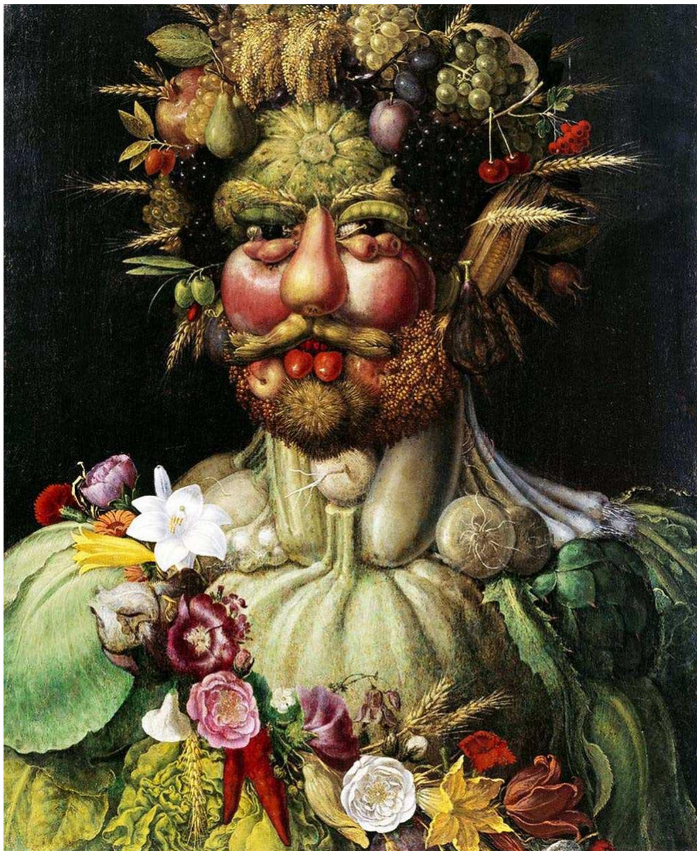
Vertumnus , by Giuseppe Arcimboldo, 1590, via Skokloster Castle, Sweden