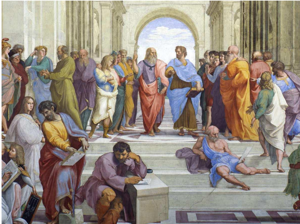
School of Athens , by Raphael, 1511

Early Modern Philosophy divided itself into two schools: rationalism and empiricism . Much like philosophical reasoning itself, the divide stems from the minds of the ancient Greeks.