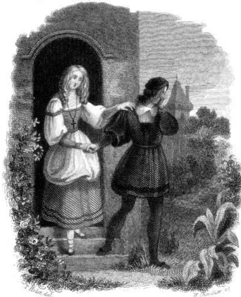
The day of my departure at length arrived.

We sat late. We could not tear ourselves away from each other, nor persuade ourselves to say the word "Farewell!" It was said; and we retired under the pretence of seeking repose, each fancying that the other was deceived: but when at morning's dawn I descended to the carriage which was to convey me away, they were all there—my father again to bless me, Clerval to press my hand once more, my Elizabeth to renew her entreaties that I would write often, and to bestow the last feminine attentions on her playmate and friend.